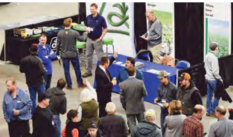
The Fargodome floor will house approximately 75 exhibitors during the day-long trade show.