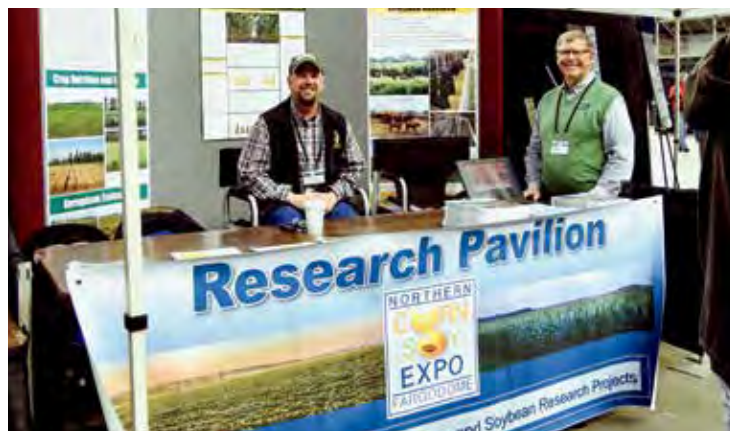
Checkoff supported information will be available from participating researchers.