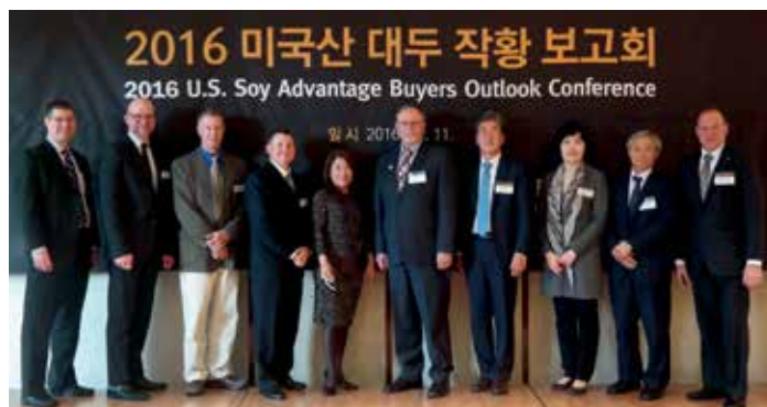
USSEC hosted the annual U.S. Soy Advantage Buyers Outlook Conference in Seoul, South Korea on November 11, 2016.